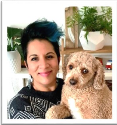
Me and my fur-baby Bowie